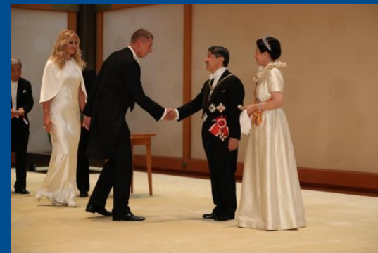
Czech Prime Minister Andrej Babiš at enthronement of Emperor Naruhito, 2019