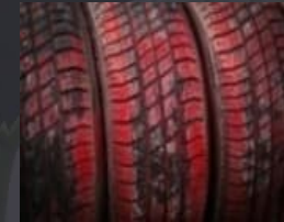
Rubber - tyres, transmission belts, other rubber products