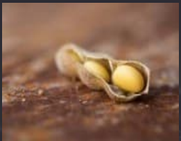
Soya - Soybeans, bean flour and bean oil