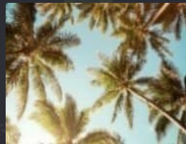
Oil palm - palm oil, nuts and seeds, glycerol, palmitic and stearic acid