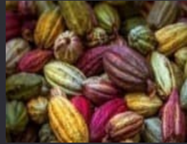
Cocoa - beans, shells, cocoa butter and chocolate