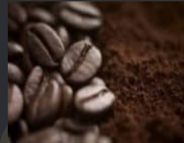
Coffee - beans, husks